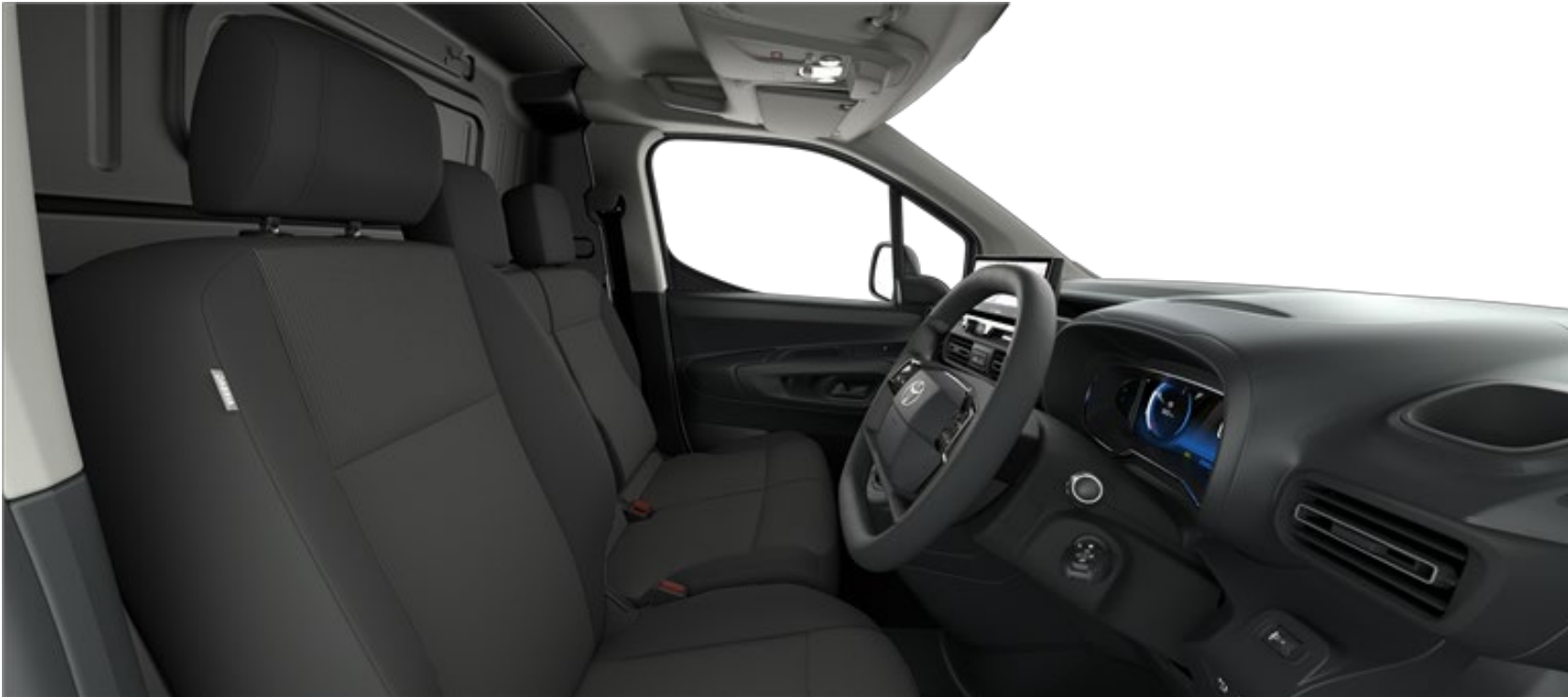
Grey fabric (CMFY)

Available in grey fabric with a unified black instrument panel that delivers a fresh image.