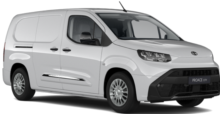
Icy White (EPR)