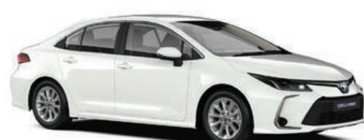
Pearl Ice White (089) ***