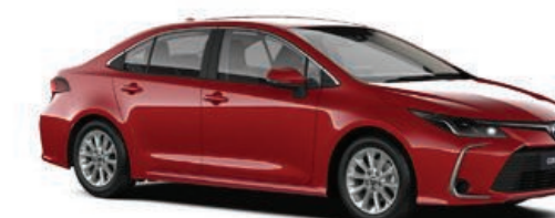
Pearl Red (3U5) ***