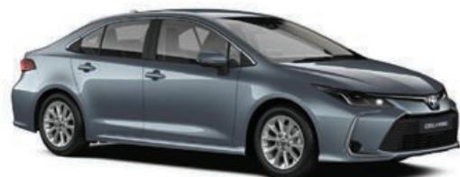
Celestite Grey (1K3) **