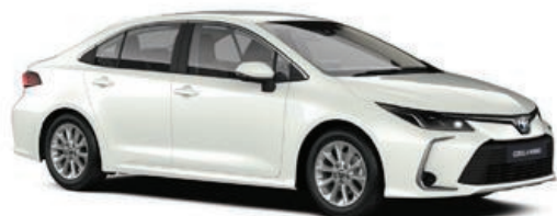
Pure White (040) *