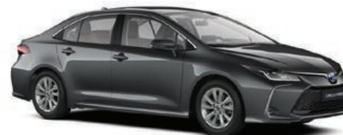
Ash Grey (1G3)**