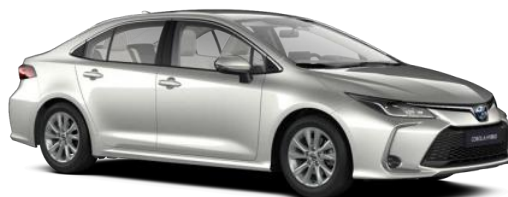
New Precious Silver (1J6) **